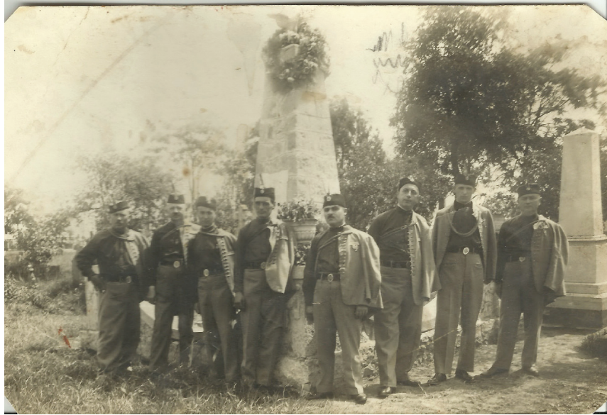
The leadership of the Stara Pazova Sokol Society in front of the monument to the volunteers and heroes of the Great War, late 1920s

The role of Slovaks in the development of Sokolism in Stara Pazova: unity under the Slavic banner