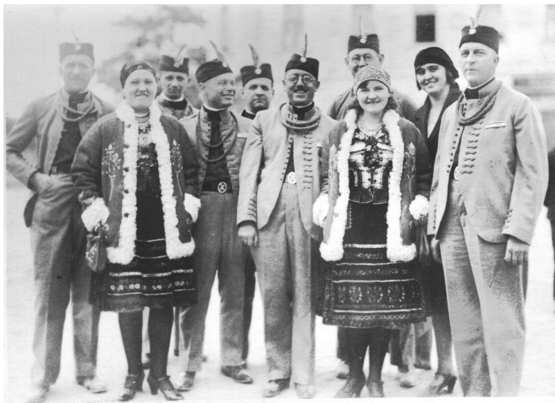
Members of the Sokol Society Stara Pazova with female members dressed in Slovak folk costume