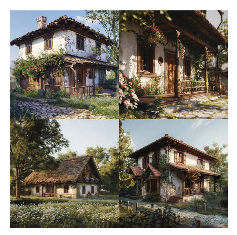
The result: an example of the traditional Serbian house built in Morava style, as seen by Al

Midjourney and Discord as a platform may with time grow into a place for networking Serbian artists, designers and architects, as well as become a creative online hub for discussing art topics and collaborating on projects, either within the academic community or economy. The absolute benefit is that artificial intelligence in this case can definitely help in finding and connecting similar talents from different artistic, as well as technical-technological fields based on similar interests and professional goals in the future.