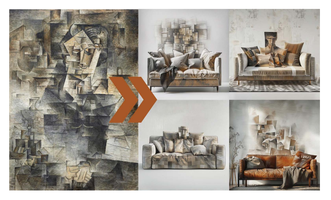
The result of the experiment of generating a work by Picasso

By analyzing different trends, technological innovation and styles, we have observed key characteristics and potential brought by new arts in the future. They constitute a fascinating, dynamic and infinitely unexplored space of creativity that is constantly shaped under the effect of technological, cultural and social changes in which we live. Being interdisciplinary, under the effect of AI as a new medium, they will give us new findings, create new artistic skills and new artists for the 22<sup>nd</sup> century. Finally, the arts of the future promise an exciting and inspirational future which invites us to explore, dream and create together.