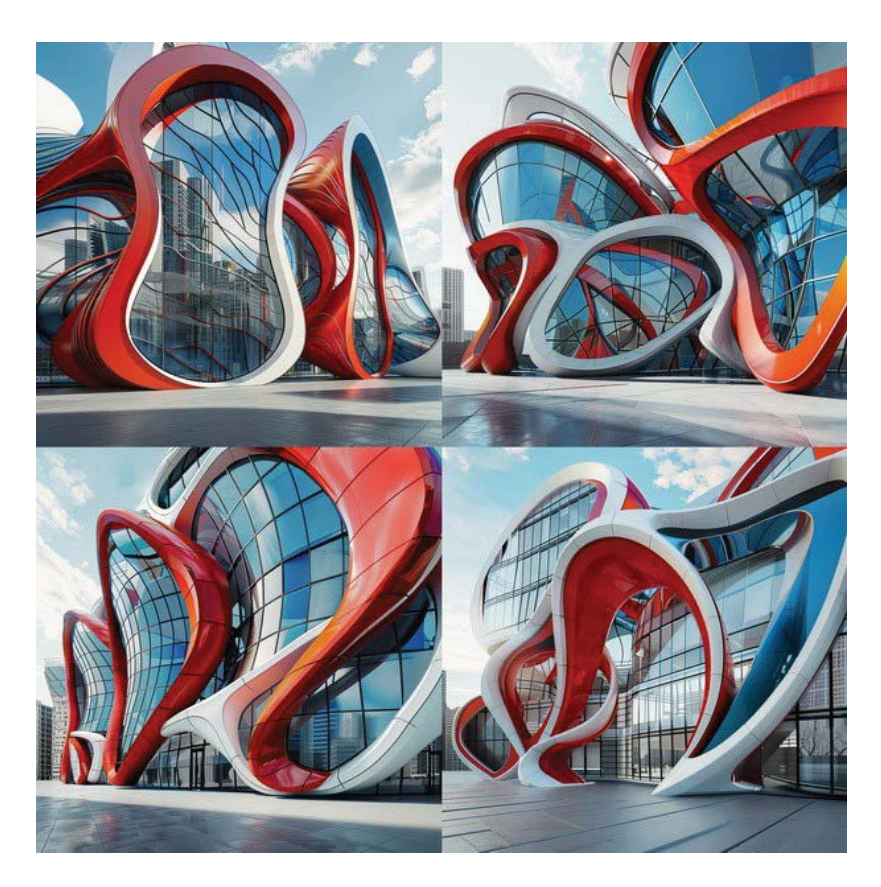
An example of exploring the form of an amorphous modern façade in the colours of the Serbian flag, as seen by Al

It is evident that the hidden creativity which is invisibly intertwined among trillions of pixels, reproduced in an unbelievably short time, also has its other hidden truth which we still cannot see, at least not legally, within regulating rights and obligations of the future "AI prompt designers"<sup>[9]</sup> in the course of this form of the generative AI creative process. Just as in any