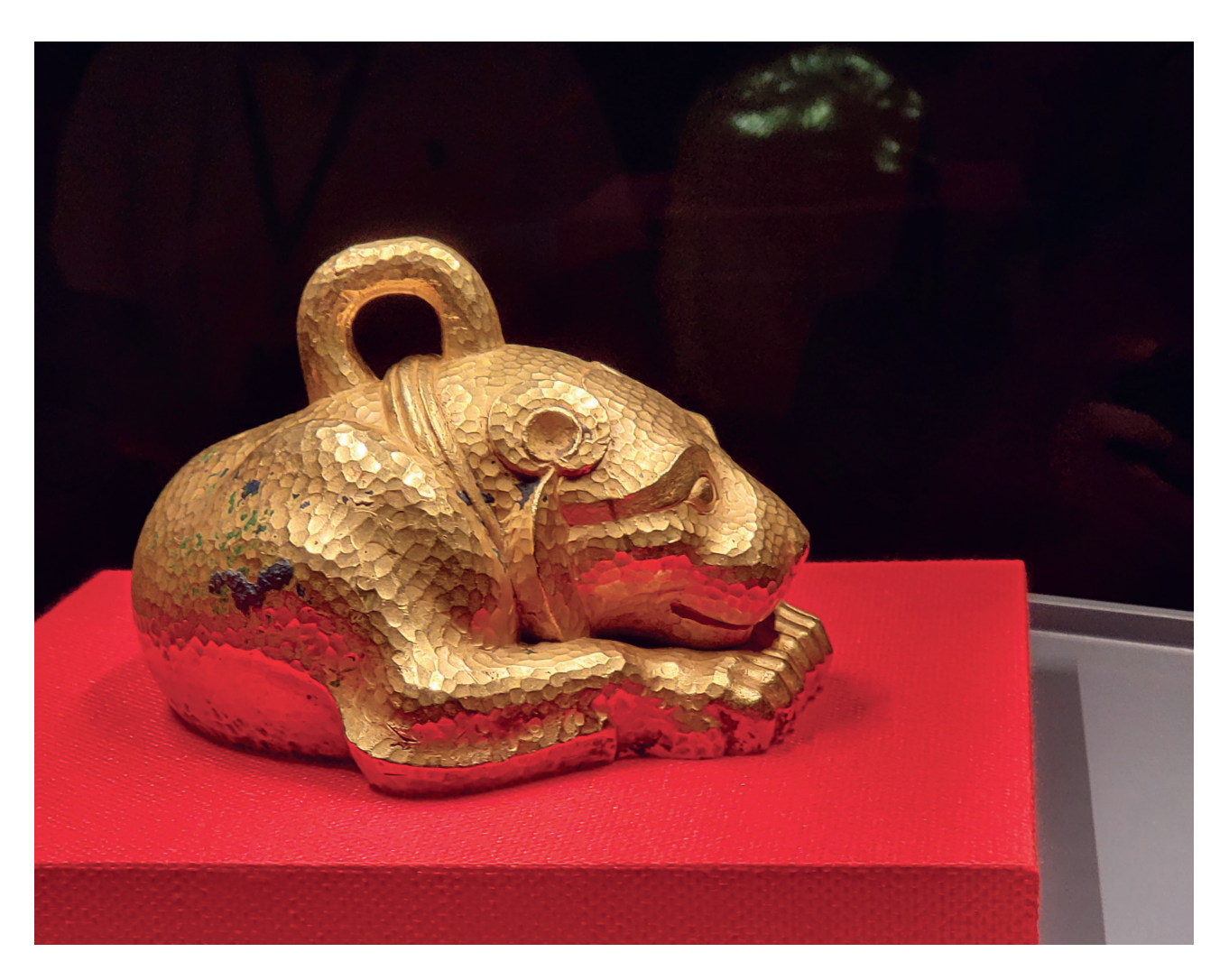
One of exceptionally valuable exhibits from the display in the Nanjing Museum

nition, and enhancing international macro-policy coordination on industrial and supply chains, thus contributing to the sound development of economic globalization and the building of an open world economy.