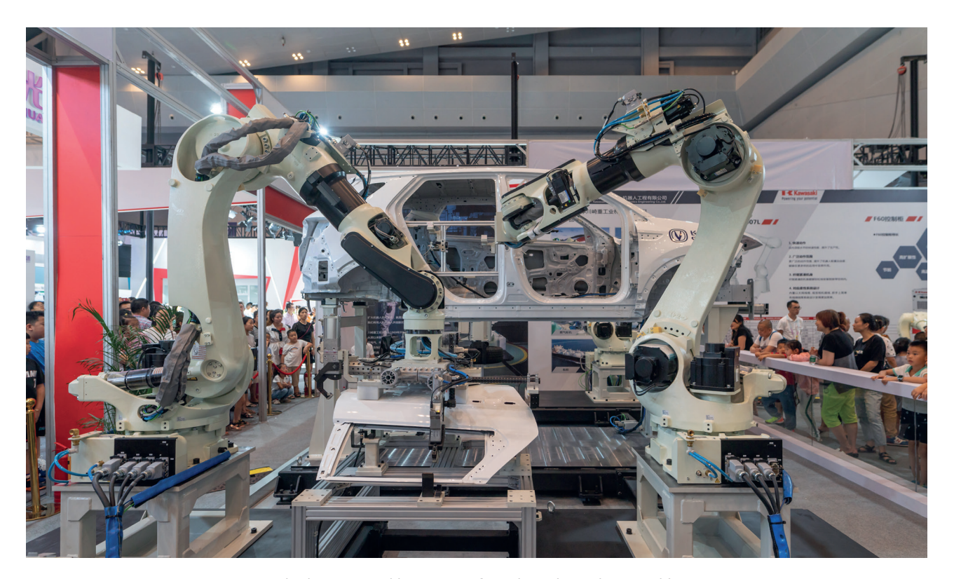
Robotic arms used in car manufacturing, Chongqing, PR China

The CISCE has deepened interactions between Chinese and foreign businesses. It has built a platform of cooperation for various players of global industrial chains. Chinese and foreign exhibitors demonstrated fruits of industrial and supply chain cooperation. For instance, GE and Sinopharm established a joint booth and launched their joint venture. Qualcomm Incorporated and China Mobile, Xiaomi, and iQIYI showcased their success stories of cooperation. More importantly, Chinese and foreign exhibitors used the industrial and supply chains as a media to present themselves and deepen