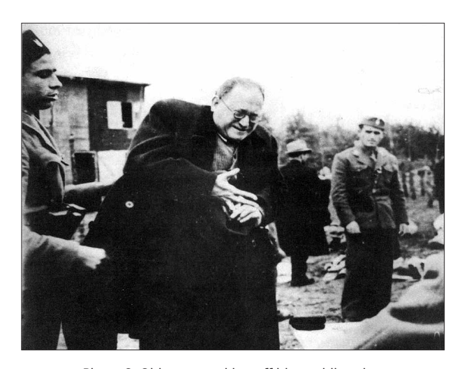
Photo 6: Older man taking off his wedding ring at the camp entrance.