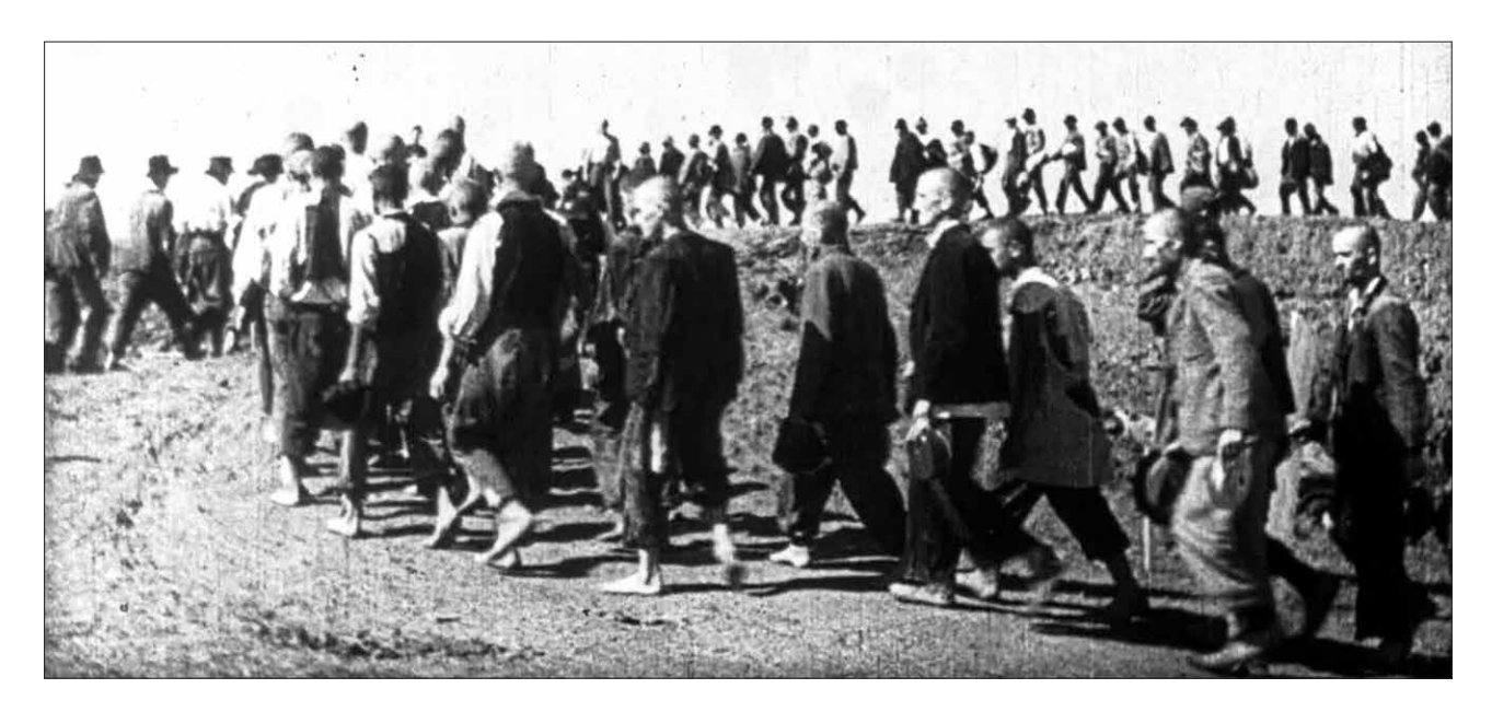
Photo 7: Rounding up Jasenovac inmates

Important as it is, the number of victims should not be considered the most important method concerning Auschwitz or Jasenovac. Since the death of one person is a tragedy of itself, for the tortured and murdered person the question of how many others were murdered is not important.