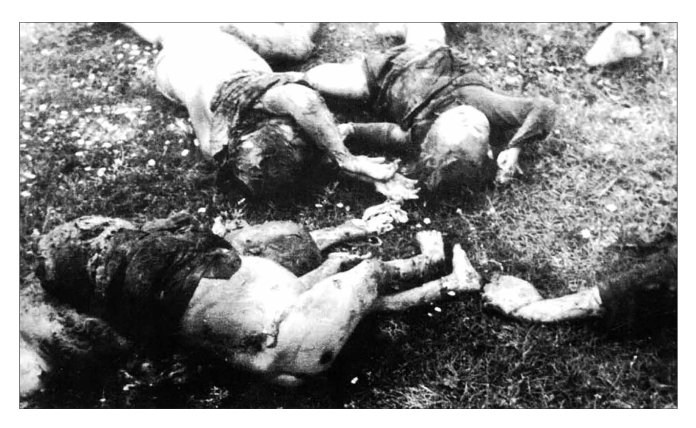
Photo 16: Ustasha crimes against children in Srebrenica, 1941