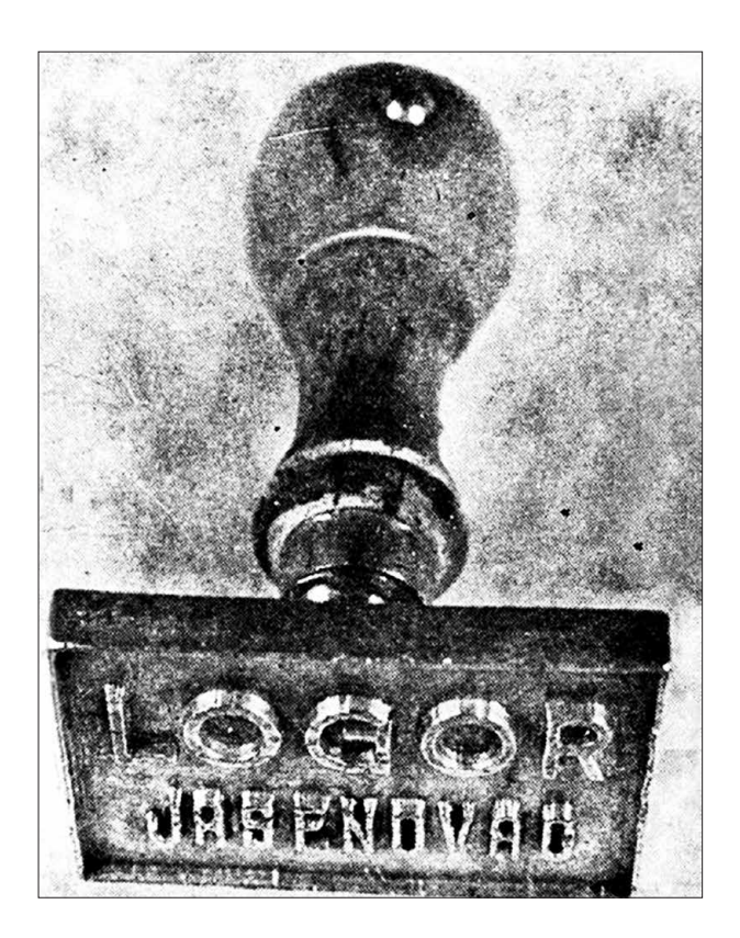
Photo 9: Seal of Jasenovac camp. Photo documentation Donja Gradina Memorial Site. Taken, with the permission of the author, from the book Jasenovac, Auschwitz of the Balkans by Gideon Greif (Teper LTD, Garey Tikva, Israel, 2021)

from 500 000 to 600 000.<sup>[16]</sup> The historian Tomislav Dulić says that there were 700 000 killed in Jaseno-