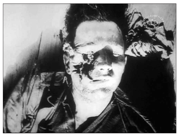
Photo 14 Photo: Archive of Yugoslav Cinematheque. Taken, with the permission of the author, from the book Jasenovac, Auschwitz of the Balkans by Gideon Greif (Teper LTD, Garey Tikva, Israel, 2021)

Photo 12: Ustasha crime: decapitation, December 1942. Photo documentation of the Museum of the Victims of Genocide, Belgrade. Taken, with the permission of the author, from the book Jasenovac, Auschwitz of the Balkans by Gideon Greif (Teper LTD, Garey Tikva, Israel, 2021)