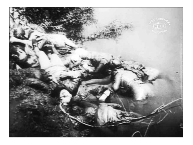
Photo 18: Dead bodies were just thrown into the river. Source: Archive of Yugoslav Cinematheque. Taken, with the permission of the author, from the book Jasenovac, Auschwitz of the Balkans by Gideon Greif (Teper LTD, Garey Tikva, Israel, 2021)

Photo 17: Divoselo (Lika), A girl stabbed by knife. Italian photos of Ustasha Crimes. Photo documentation of the Museum of the Victims of Genocide, Belgrade. Taken, with the permission of the author, from the book Jasenovac, Auschwitz of the Balkans by Gideon Greif (Teper LTD, Garey Tikva, Israel, 2021)