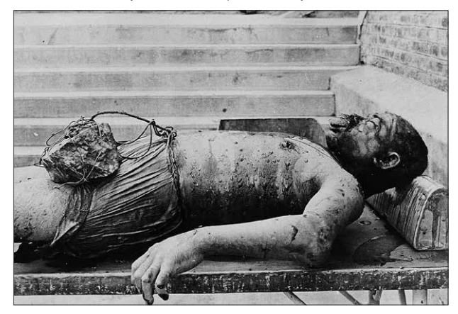
Photo 15: Victim of Ustasha terror with a stone around waist and in the mouth. The corpse was taken out from the Sava River, downstream from Jasenovac. The shot was taken in 1945.